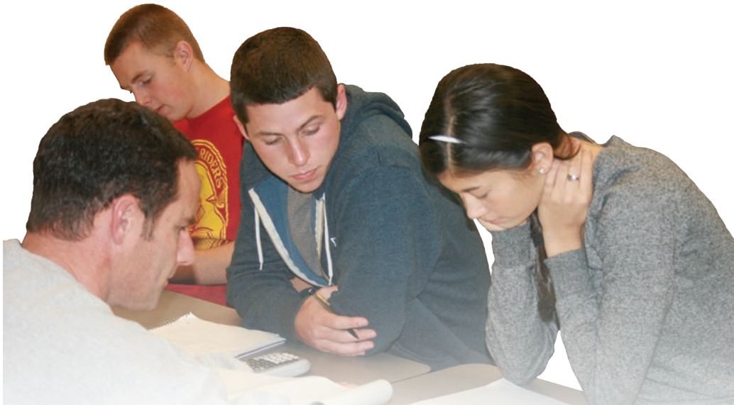
Middle and high school students currently purchase expensive graphing calculators, which could be downloaded on computer devices in the future, further lessening the financial burden for families.

*The rates above are estimates based upon the assessed value data available in fall 2011. We anticipate a decline in assessed value based upon information from the Whatcom County Auditor's Office, which is how the above estimate is calculated.