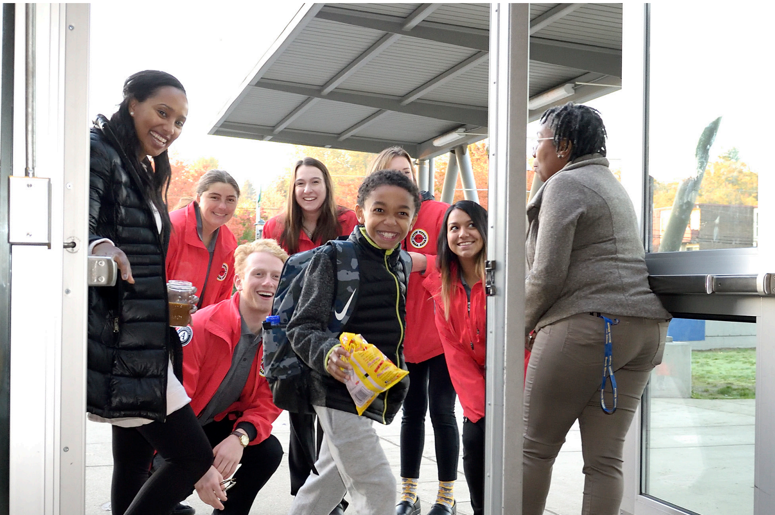
Students and educators at South Shore PreK-8